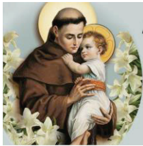
Saint Anthony of Padua

This weekend is the final ShareLife Sunday of the year. But ShareLife is more than a collection. It's how we as a community say "we care." In solidarity with Catholics throughout the Archdiocese, we provide a witness of God's love by actively supporting those in need locally and the greater world.